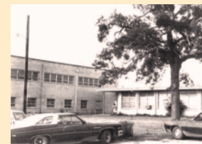
Aycock High School Circa 1950