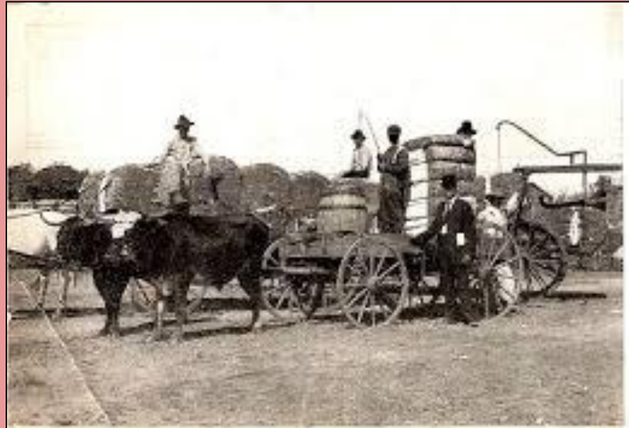
COTTON YARD, ROCKDALE, TEXAS (Published for Miller Brothers)

The railroad gave area farmers access to markets for their crops, gave the people transportation and Rockdale became a shipping point for farmers and other local businesses.