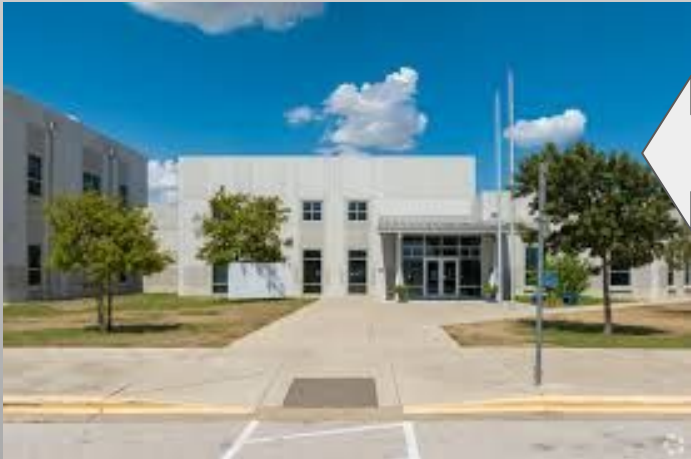
Reagan Elementar y